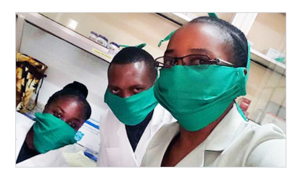
All staff are now required to wear masks.